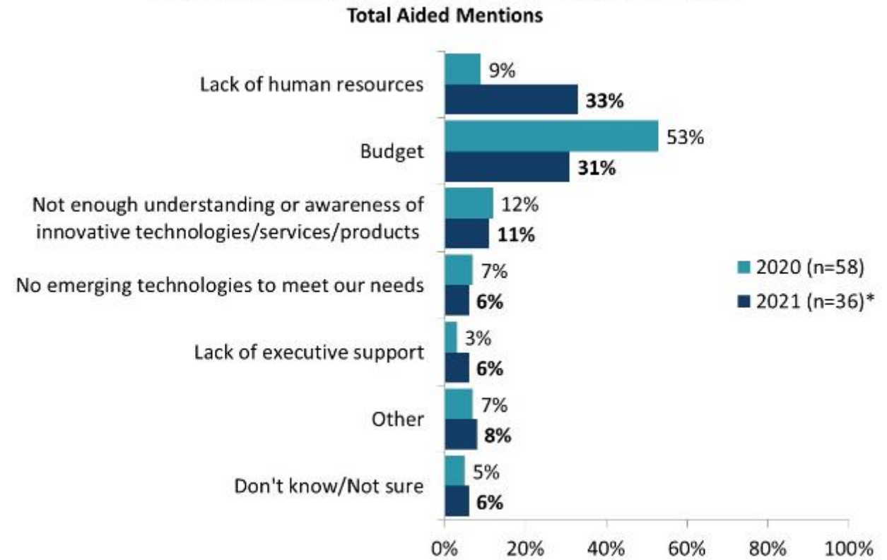
Q.C9: What is the top innovation barrier for your organization? *Caution: Small sample size.